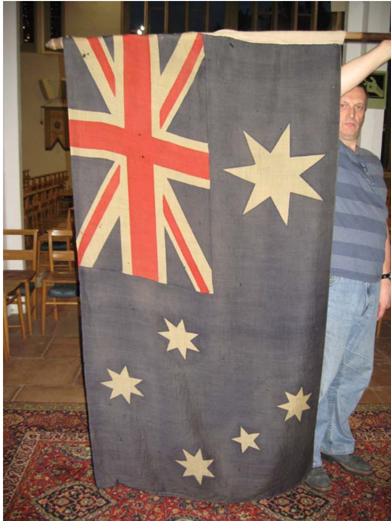
St John's Church has an Australian Flag which was presented by General Sir W Birdwood. The Plaque (below) commemorates this event.