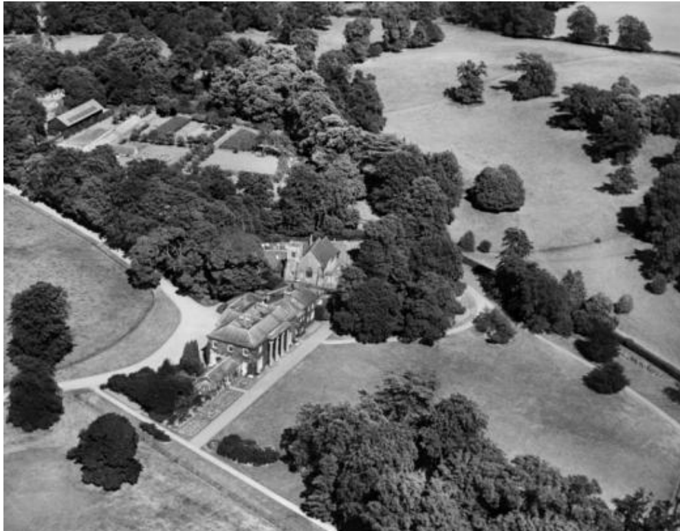
Digswell House and adjacent St John's Church (1928)